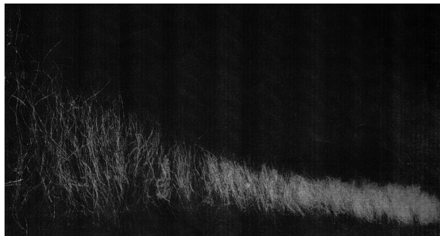
Figure 1. Distribution of fibres in the cottonised flax, mean fibre length – 27.4 mm, fibre linear density – 1.1 tex.

All tests were carried out in accordance with the BN-75/7531-01 Standard general specification, and with standard PN-