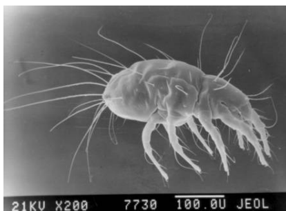
Figure 1. Tyrophagus putrescentiae .

The growth process of house dust mites, its impact upon asthmatic ailments, and the role which anti-microbial fibres may play in these phenomena have been investigated at Nottingham University and the Entomology Department at Cambridge University. Exfoliated skin cells cannot serve as a medium for the mites, as they are usually too dry and contain much fat. Under certain conditions, exfoliated skin can be degraded by the action of Aspergillus repens fungi, and thus serve as nourishment for the mites [6-8].